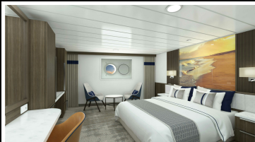
Aurora Stateroom Twin Share