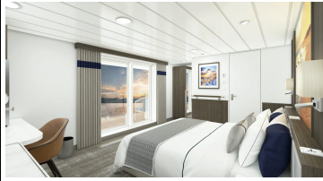
Balcony Stateroom Superior