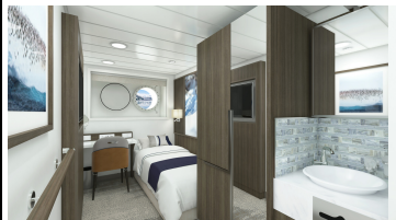
Aurora Stateroom Single